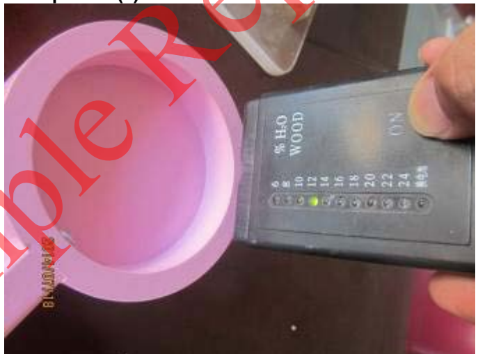
humidity check (2).JPG