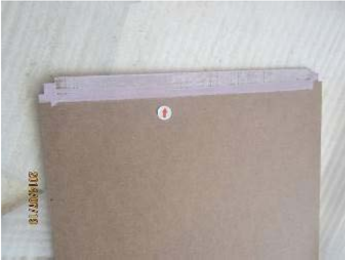
def-over painting on board.JPG