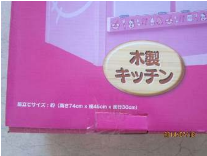
marking on color box (2).JPG