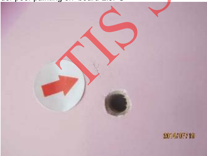
def-scratch mark on board-2.JPG