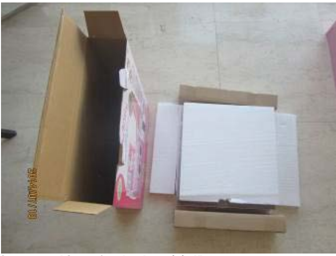
inner packing of color box (2).JPG