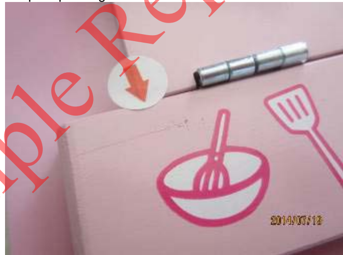
def-scratch mark on board-1.JPG