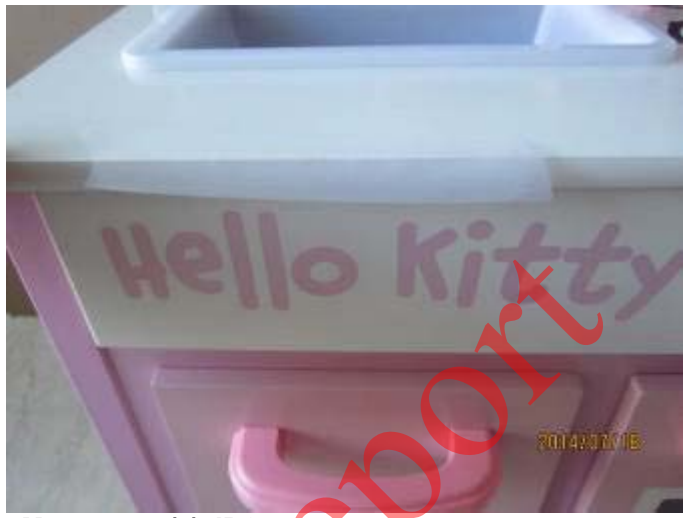
3M tape test (1).JPG