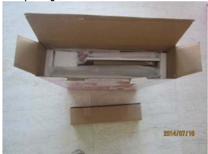
inner packing of color box (1).JPG