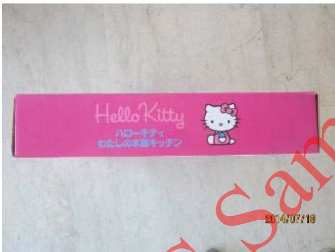
marking on color box (4).JPG