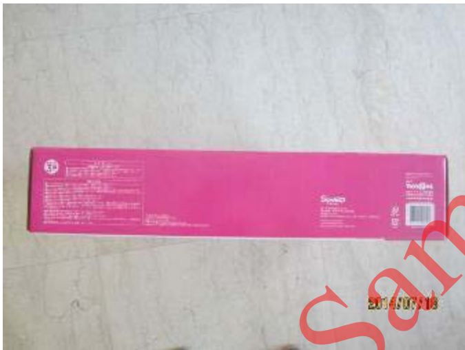
marking on color box (10).JPG