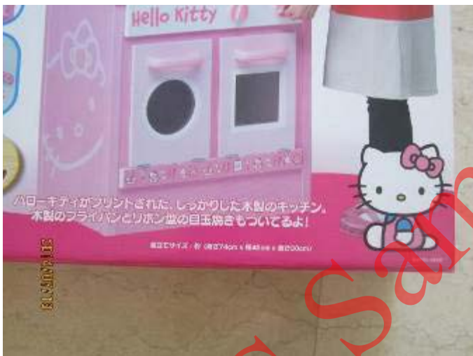
marking on color box (16).JPG