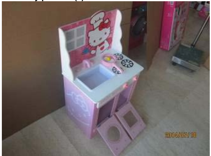
assembly product (4).JPG