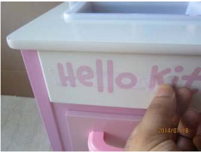
3M tape test.JPG