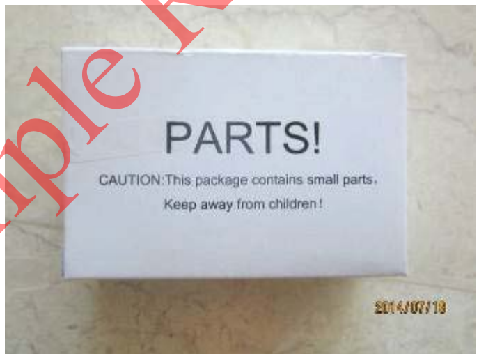
marking on color box (17).JPG