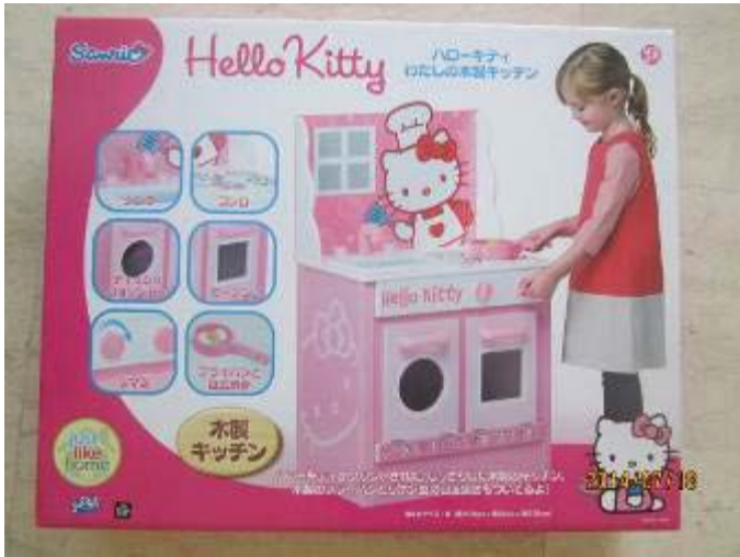
marking on color box (14).JPG