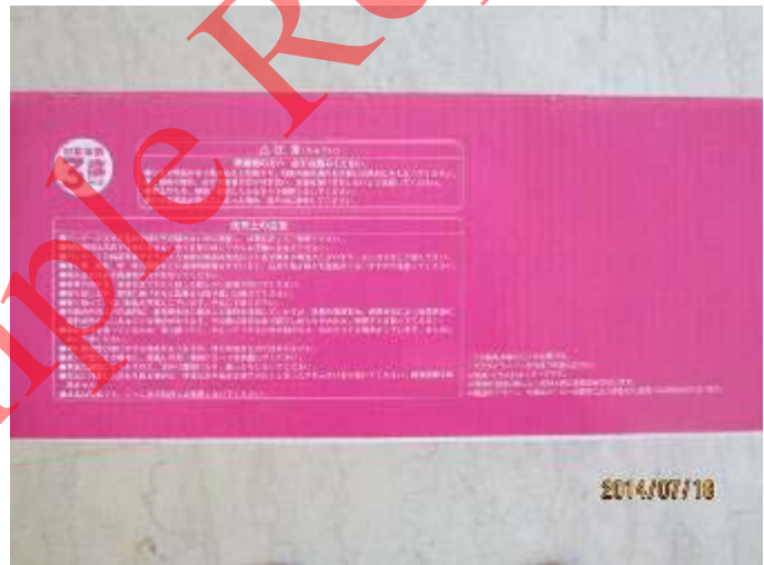
marking on color box (11).JPG