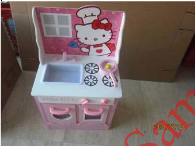
assembly product (1).JPG