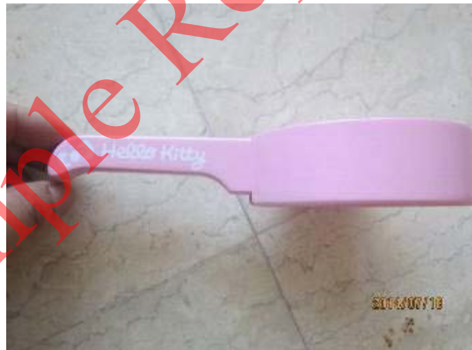
marking on product.JPG