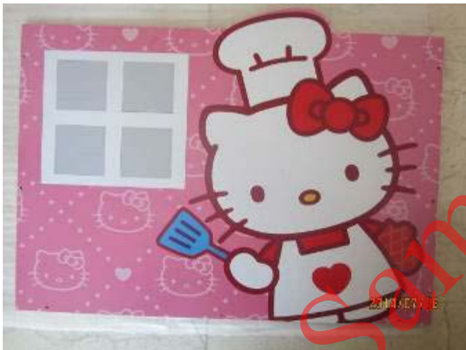
marking on product (3).JPG