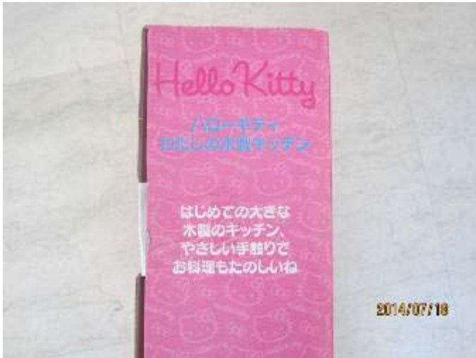
marking on color box (8).JPG