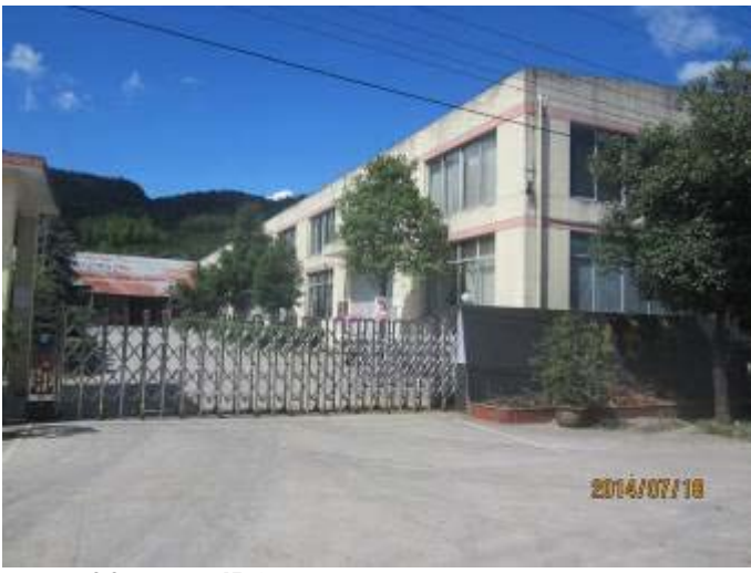
gate of factory.JPG