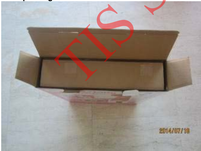
inner packing of color box.JPG