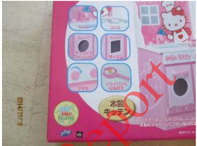
marking on color box (15).JPG