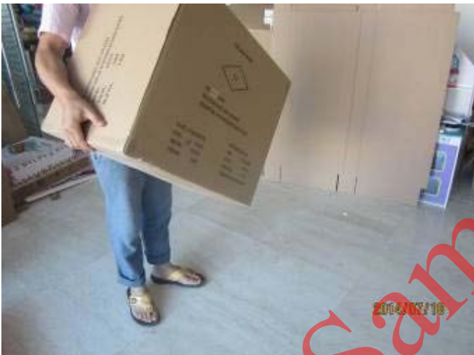
carton drop test.JPG