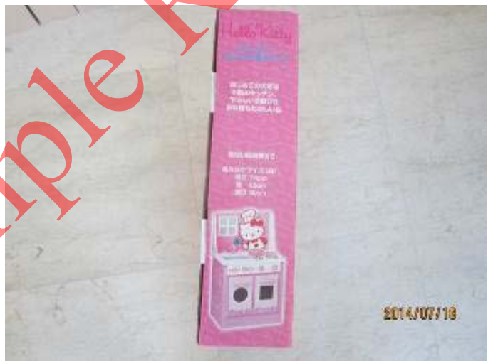
marking on color box (5).JPG