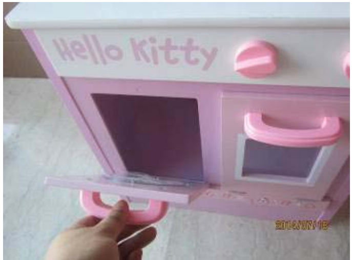
function check (1).JPG