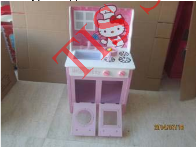
assembly product (3).JPG