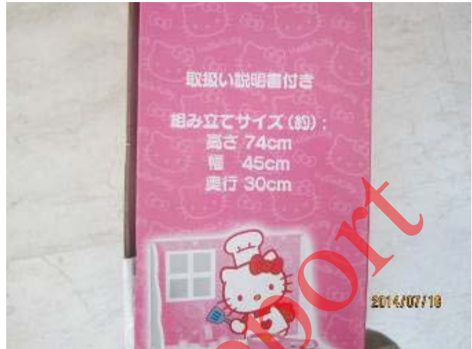
marking on color box (9).JPG