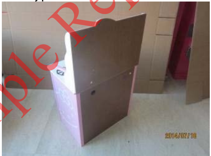
assembly product (2).JPG