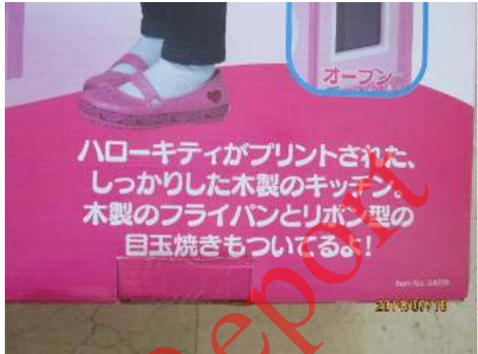
marking on color box (3).JPG