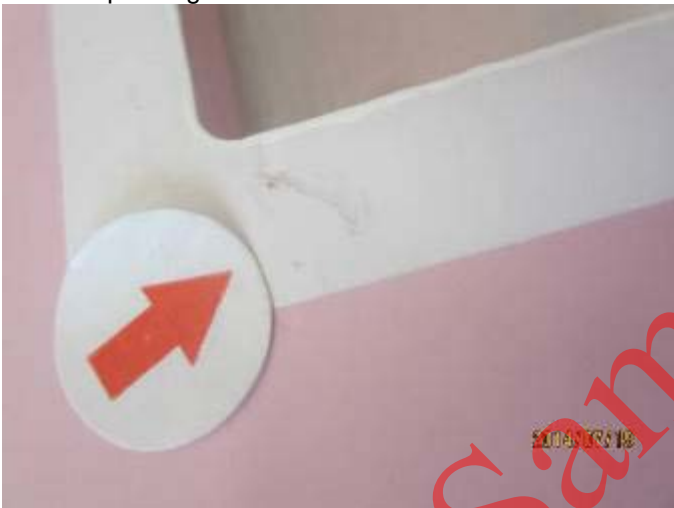
def-poor painting on board-2.JPG