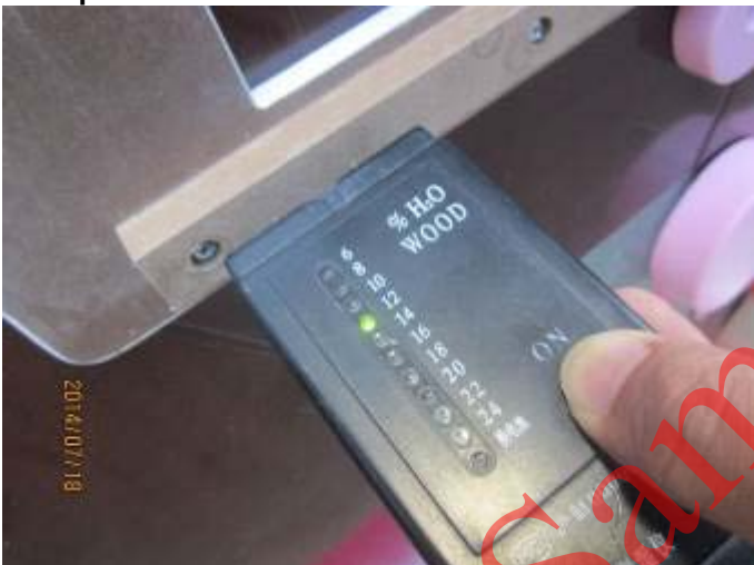
humidity check (1).JPG