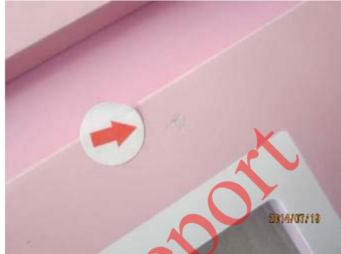
def-poor painting on board-1.JPG