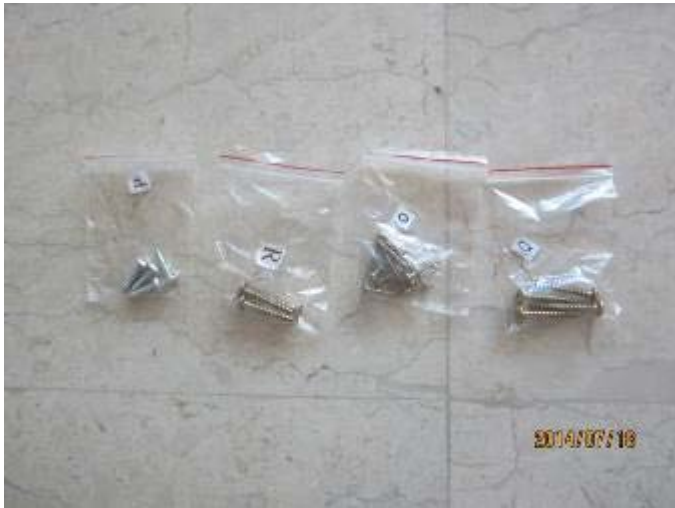
marking on accessories packing bag.JPG