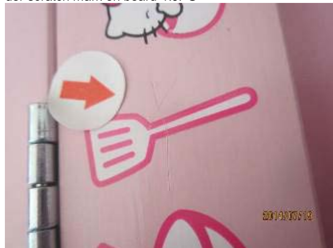
def-scratch mark on board-3.JPG